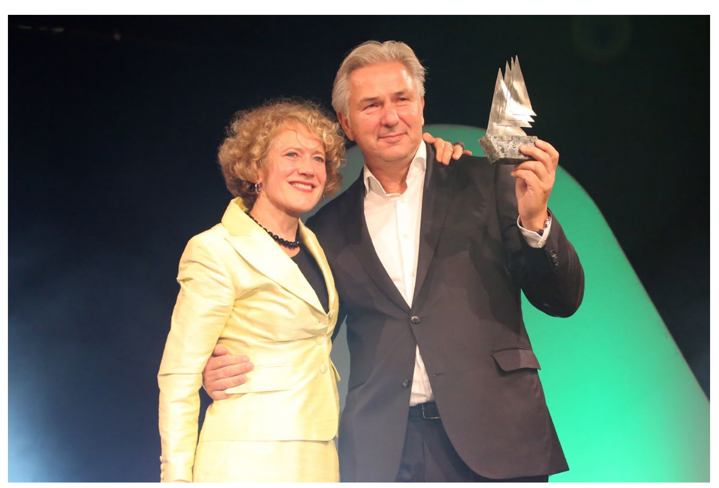
Berlin, 12 October 2015 -Presentation of the Tolerantia Awards 2015 in TIPI am Kanzleramt. Image: Klaus Wowereit, former Governing Mayor of Berlin, and Corine Mauch, Mayor of the City of Zurich.